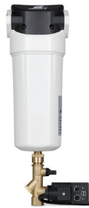
AUTO DRAIN OPTION